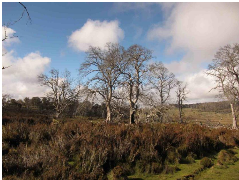
Picture showing dead Miema Cider Gum, Lakes District