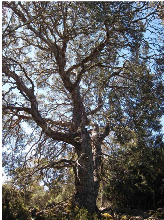
Miena Cider Gum, Central Highlands.