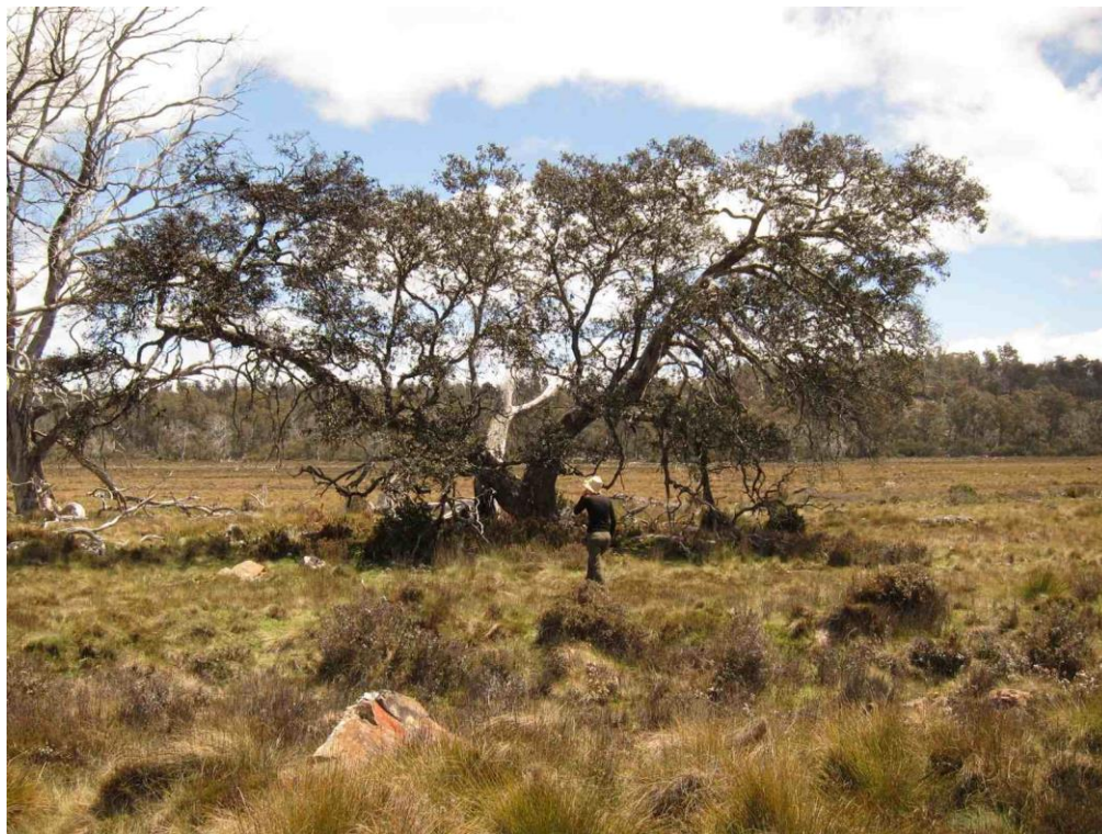
Photo showing 'Old classic' Miena Cider Gum, Lakes district.