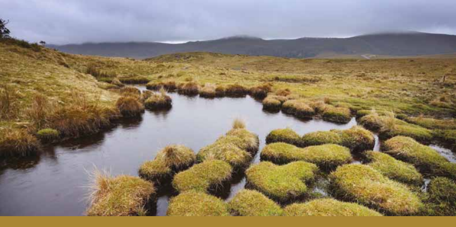
Vale of Belvoir (Wolfgang Glowacki)